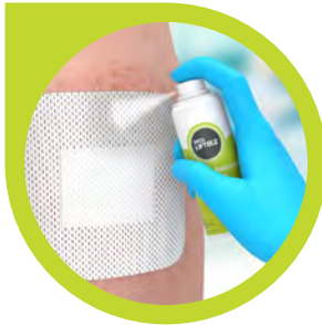
Use on Porous Material (LIFTEEZ Aerosol & Wipes)