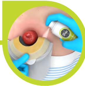
Use on Non-Porous Material (LIFTEEZ Aerosol & Wipes)